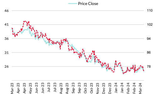
Berli Jucker (BJC TB)

● Upside ระยะยาวต่อผลประกอบการ เรามีมุมมองบวกต่อพัฒนาการดังกล่าว คาดการขยายธุรกิจนี้จะหนุน BJC ให้ได้ประโยชน์จากการจับตลาดประชากรสูงทั้งสองประเทศ ด้วยจีนและอินเดียเป็นตลาดต้นทางหลักของอุตสาหกรรมท่องเที่ยวไทย จึงเป็นโอกาสที่ Big C จะใช้กลยุทธ์นำเสนอสินค้าไทยที่เป็นที่นิยมให้กับลูกค้าที่นั่นโดยตรง สำหรับธุรกิจ Big C ในฮ่องกง ผู้บริหารคาดว่าจะเริ่มทำกำไรภายในสิ้นปีนี้ และเรามองว่าสาขาในฮ่องกงเหล่านี้จะหนุนแผนธุรกิจการเงิน เราคาดว่าธุรกิจ Big C ในฮ่องกงจะมีสัดส่วน 4% ของยอดขายรวมของ BJC ในปี 2569 ขณะที่ยอดขายธุรกิจในจีนและอินเดียยังเป็นสัดส่วนเล็กน้อย (<1%) ในช่วง 2-3 ปีข้างหน้า อย่างไรก็ตาม ภาวะเศรษฐกิจที่ไม่แน่นอน และพฤติกรรมผู้บริโภคที่เปลี่ยนแปลงอาจเป็นปัจจัยท้าทายสำคัญสำหรับการดำเนินงานในสองประเทศนี้